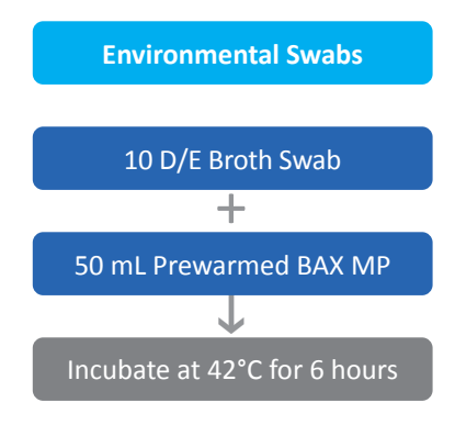
Figure 3. Enrichment protocol for Salmonella quantification (SalQuant™) with the BAX® System from environmental swabs.

Overall, the results of this study demonstrate the ability of BAX® System Real-Time Salmonella to be used for quantification from 1 − 1,000 CFU/swab after enriching environmental swabs for 6 hours. Results can be achieved simply and effectively. With the dynamic enrichment times, additional efficiencies can be utilized by developing a baseline across the processing chain to determine which enumerable range is appropriate per processing location. Using the SalQuant™ approach depicted in Figure 3 for environmental swabs, food processors will be able to better manage the processing chain for Salmonella and make data driven decisions to improve food safety.