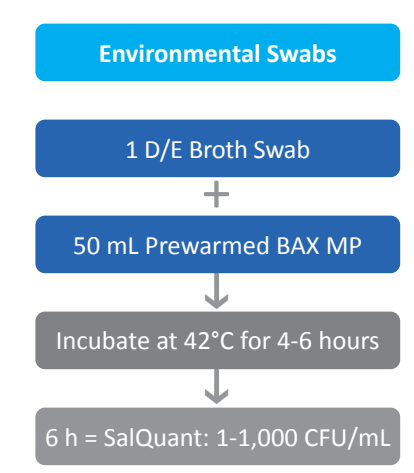
Figure 1. Enrichment procedures for SalQuant™ development.

Inoculated environmental swabs were combined with 50 mL of pre-warmed (42°C) BAX MP media. The 60 mL solution was incubated at 42°C for 4-6 hours. Samples were removed at 4, 5, and 6 hours and tested in quintuplet by the BAX® System method described in the figure. Additionally, MPN verification was performed across each inoculation level to determine background Salmonella levels and estimation accuracy of SalQuant<sup>TM</sup>.