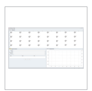
Create rack file and warm up cycler.