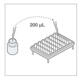
Mix protease with lysis buffer and dispense 200 μL of solution into cluster tubes.