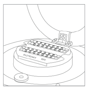
Place sealed PCR tubes in cycler and immediately click "NEXT" to run program.