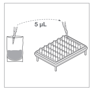
Transfer 5 µL sample enrichment to cluster tubes.