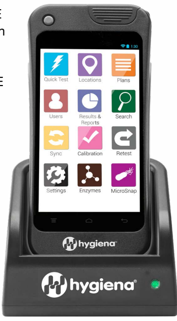
EnSURE Touch and Charging Dock

to support your food safety program. EnSURE Touch features a 5" touch screen, wireless sync technology, and cloudbased software. EnSURE Touch is designed to adapt to your workplace, providing the data you need for complex multilocation supply chain monitoring, audit and risk management, and recall prevention.