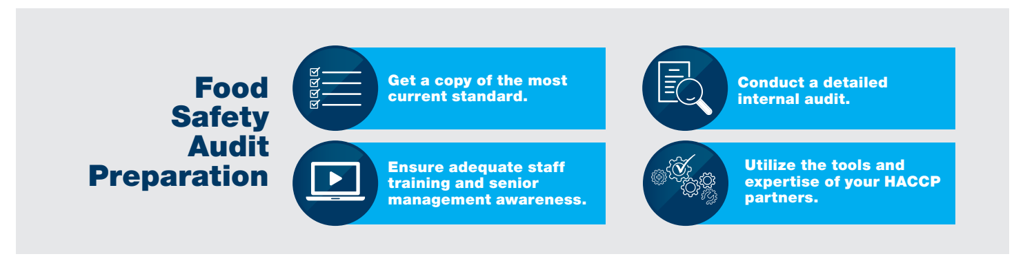
Figure 2. Steps for Audit Preparation

1. Obtain a copy of the most recent certification scheme requirements to ensure auditor expectations and requirements are very clear.