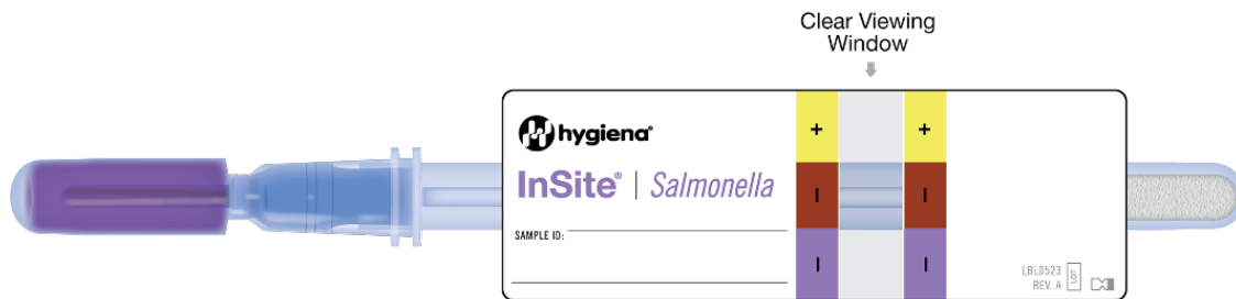
Results in the Viewing Window of the InSite Device (This diagram shows the label laid out flat.)