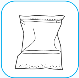
Enrichment or rinse sample